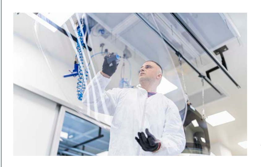
Isoclima glass processing

Unified by a wealth of cross-sector knowledge and cuttingedge technologies, our solutions stand out for their ability to balance sophistication and function.