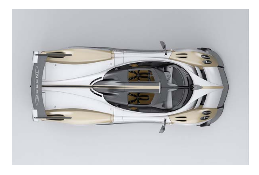
Huayra R Evo

As a trusted partner to the industry's leading automotive brands, Isoclima brings transformative value to every project.